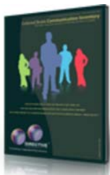
Colored Brain Communication Inventory (CBCI)