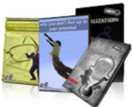
Video DVDs and Audio CDs