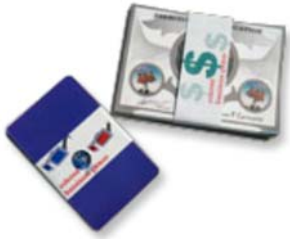
Colored Business Game